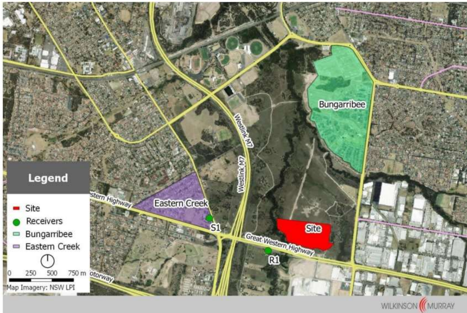
Nearest Sensitive Receivers