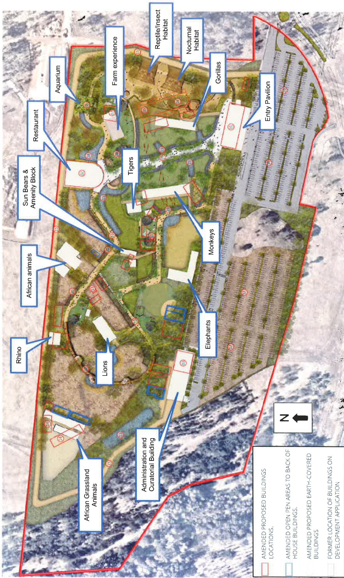
Figure 4: Proposed amendments to the approved site layout