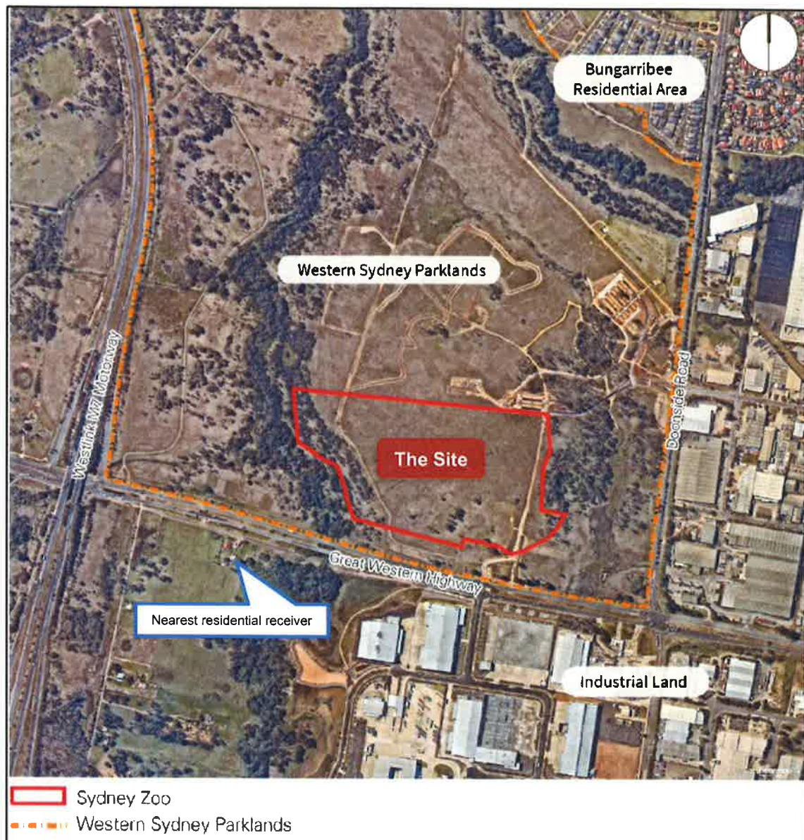
Figure 2: Site context

The site is predominantly cleared of vegetation with small areas of Cumberland Plain Woodland and River Flat Eucalypt Forest (see Figure 2 ). The remainder of the site contains exotic grasslands with some weeds.