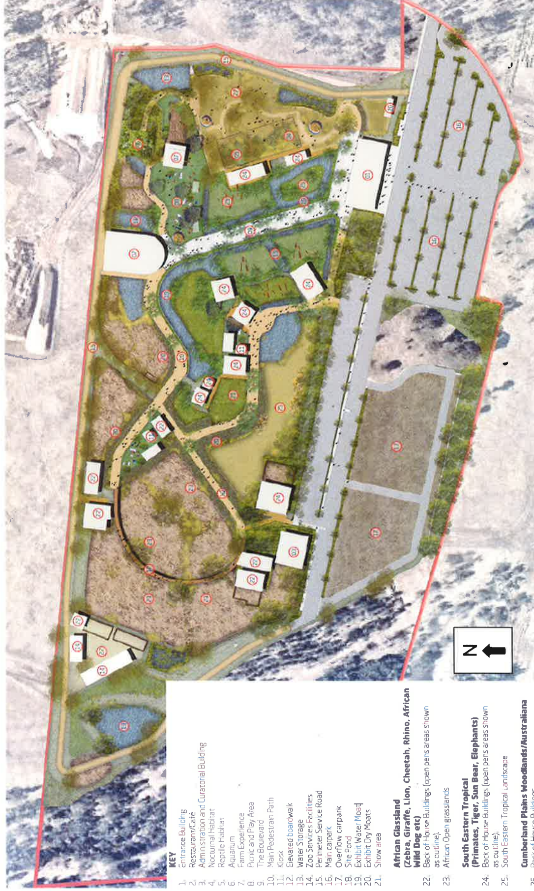
Figure 5: Proposed site layout